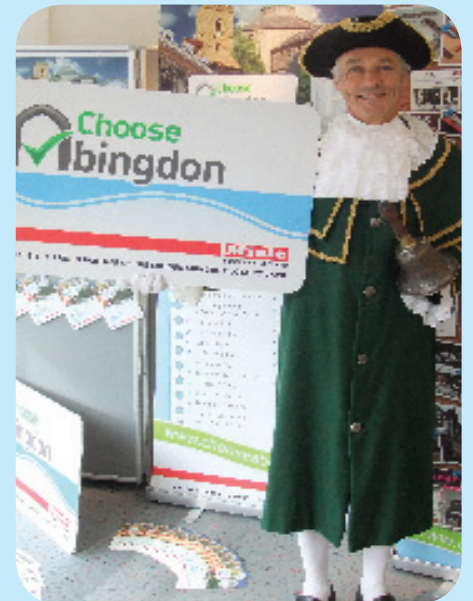
The Town Criers helped to promote the Choose Abingdon Loyalty Card

For only £3 (which covers the cost of the chip technology in the card) you can purchase a loyalty card that gives you rewards at participating shops. Lookout for the Choose Abingdon Loyalty Card logo in shop windows.