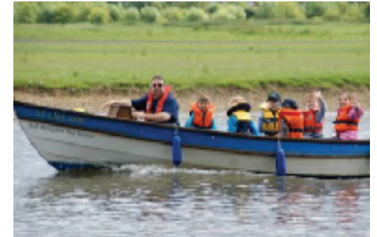
2nd Abingdon Scout Group