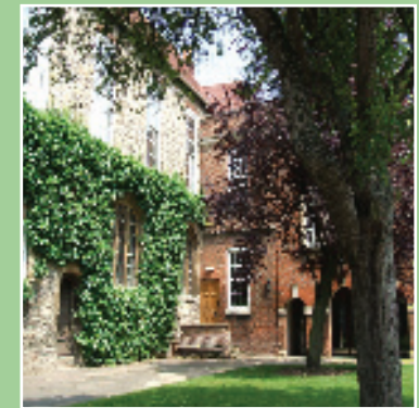
Roissey Court, a part of the Guildhall complex

The future of the Guildhall is being secured as a result of negotiations between the Town Council and the Vale of White Horse District Council. The Town Council sees the Guildhall as an important community facility which houses the collection of town treasures. Since 1974, when the Borough Council was dissolved, the District Council has owned and operated the Guildhall. However, both Councils agreed that the Town Council is best placed to run the Guildhall. The Town Council aims to take over the Guildhall complex in April, when it will be reviewing the needs and requirements of the consumer, exploring opportunities for increasing the use of the facilities and looking at how to attract more bookings.