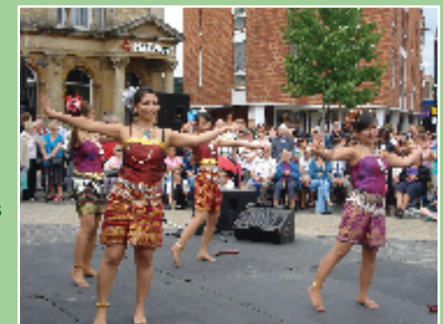
Land of Smile - Thai Dancers at last year's Abingdon's Got Talent