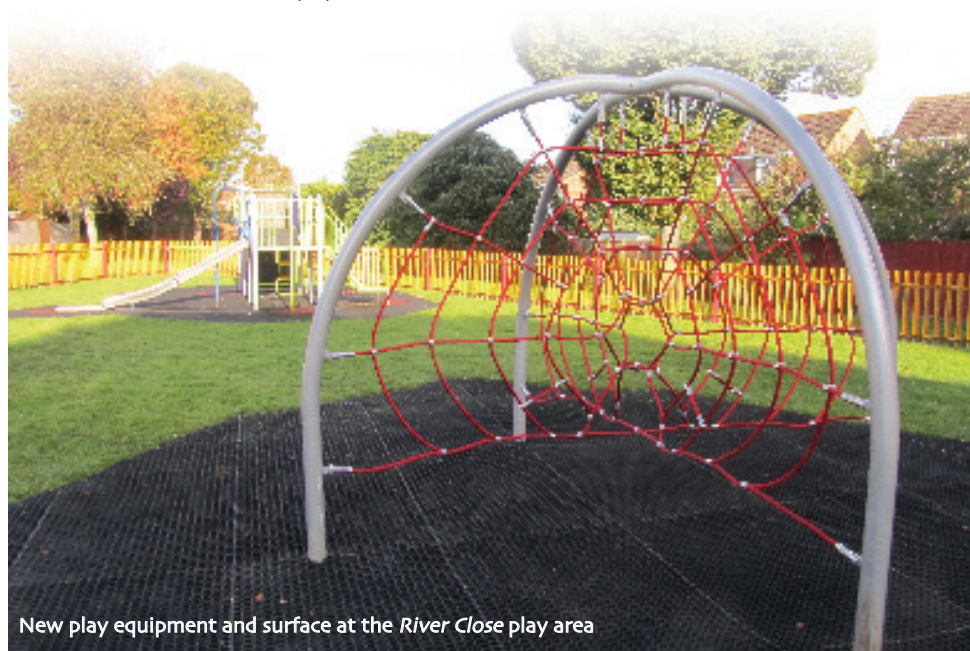
New play equipment and surface at the River Close play area

Of the eight play areas, four will see new investment this year. New equipment and better surfaces have already been installed at River Close, Caldecott, Chauntrell Way and Hillview. At Elizabeth Avenue, where the grass gets very worn, a suitable surface will be laid in front of the popular kick wall.