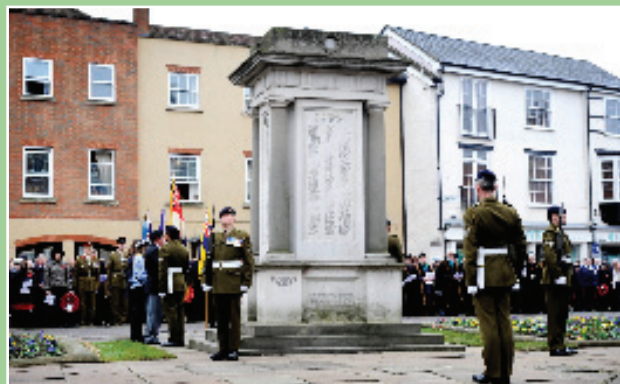
Remembrance Sunday, 14 November 2010