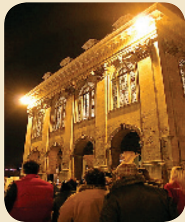
County Hall Museum at night