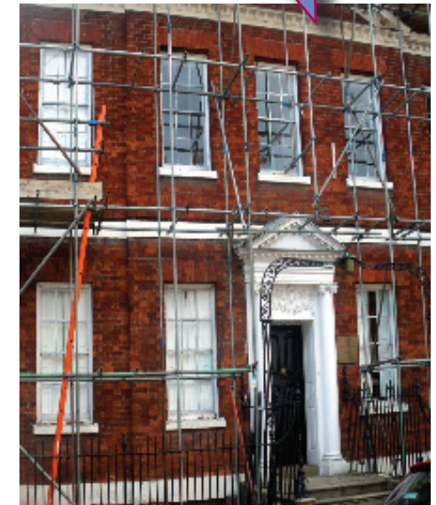
Twickenham House - part of the Old Gaol Development

All planning decisions are non-party political. The planning rules are set by Government. Abingdon Town Council is a consultee and the District Council makes the decisions. If you have any planning concerns or need further information, contact the Vale of White Horse District Council, Abbey House, Abbey Close www.whitehorse.gov.uk or call 01235 520202.