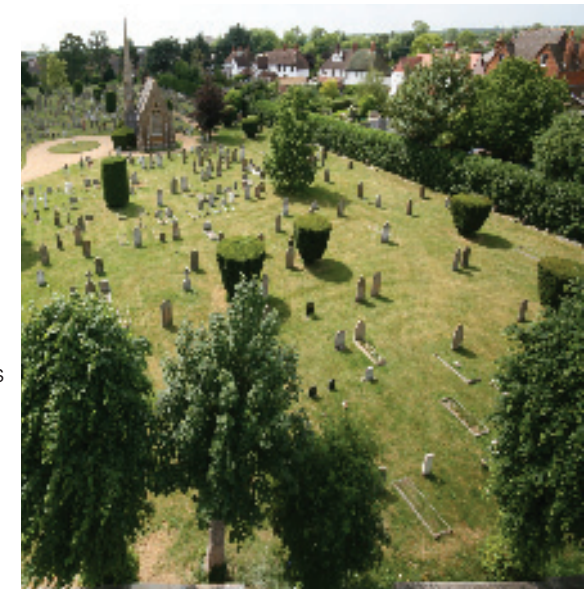
Chapel in the Old Cemetery

The driveway in the Spring Gardens Cemetery will be resurfaced to improve accessibility and the environment of the area. The depot is undergoing a facelift with a new toilet for visitors and a new office for cemetery enquiries.