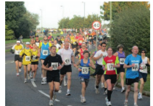
Runners at the Abingdon Marathon

The Council also administers the Burgess Trust which offers grants to encourage young people, between the ages of 17 and 25, to undertake educational projects in our twin towns.