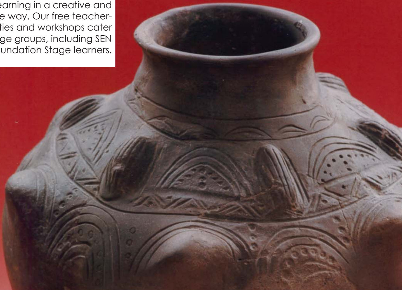
Anglo-Saxon earth pot c. 850 found in Abingdon.

With an extensive range of artefacts for handling, costumes, and displays available we can help support learning in a creative and interactive way. Our free teacher-led activities and workshops cater for all age groups, including SEN and Foundation Stage learners.