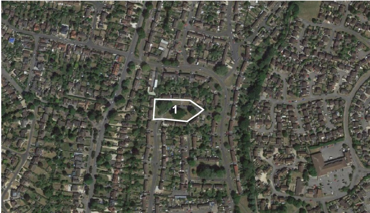
1. Welford Gardens Green