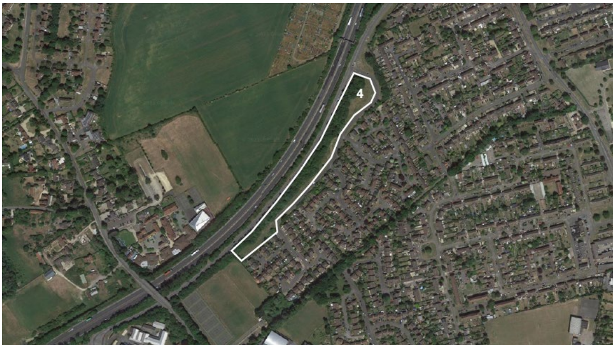
4. Land between Mons Way to the east and west of Copenhagen Drive