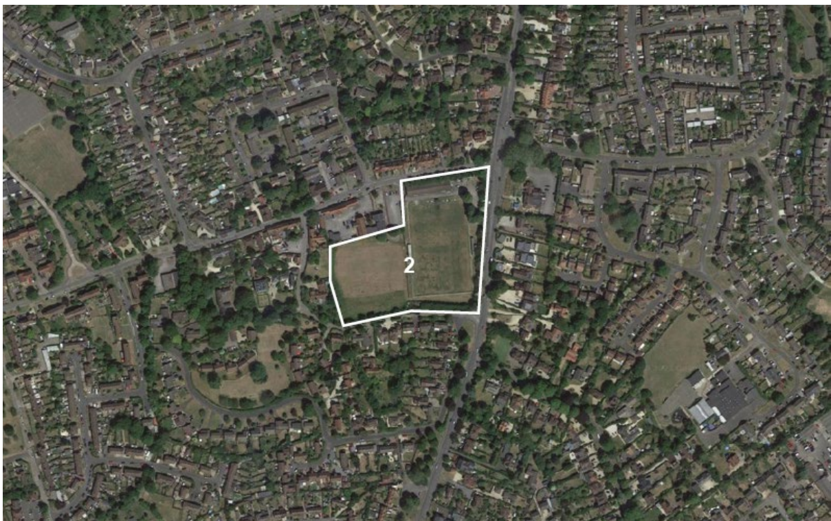
2. Green space contained by Northcourt Rd, Oxford Rd and Northcourt Lane