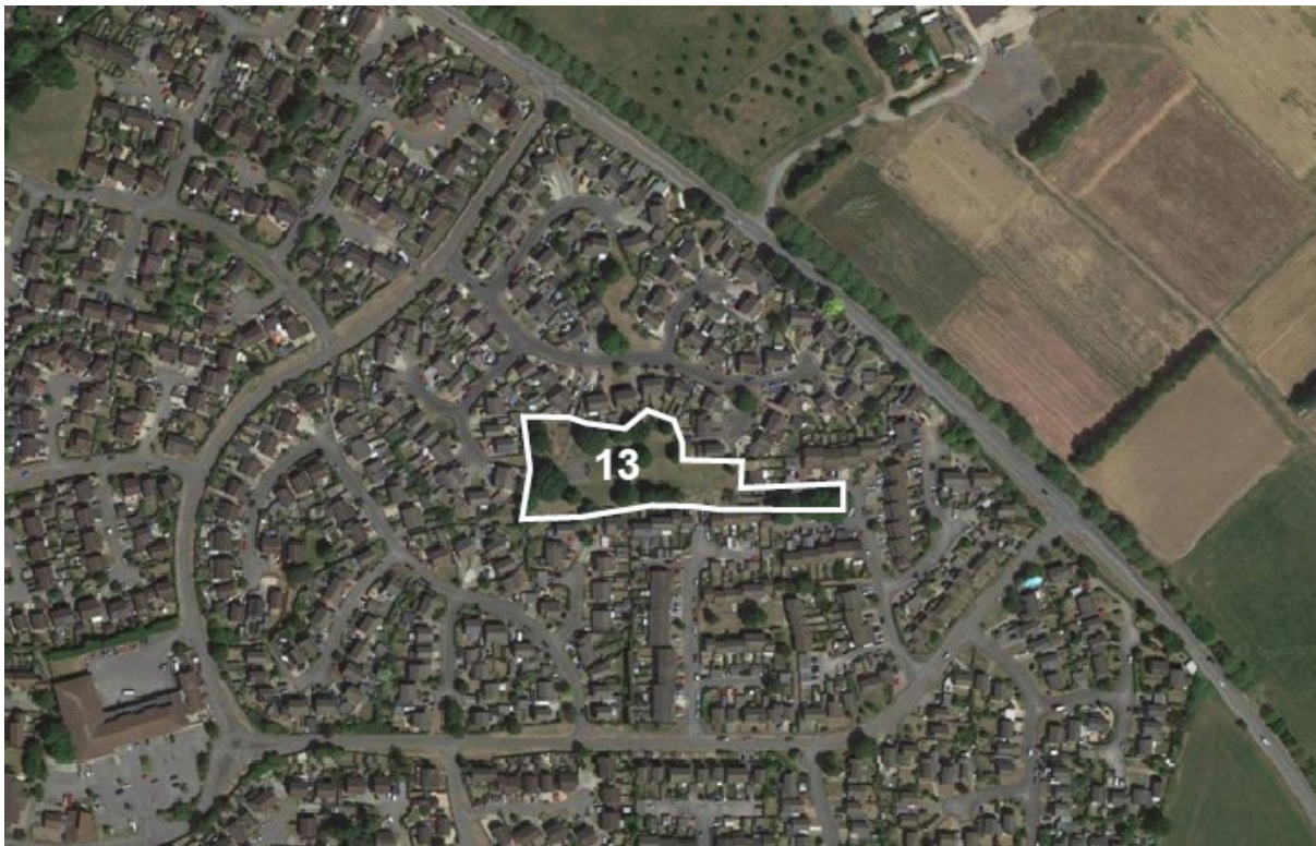
13. Elizabeth Avenue Play Area