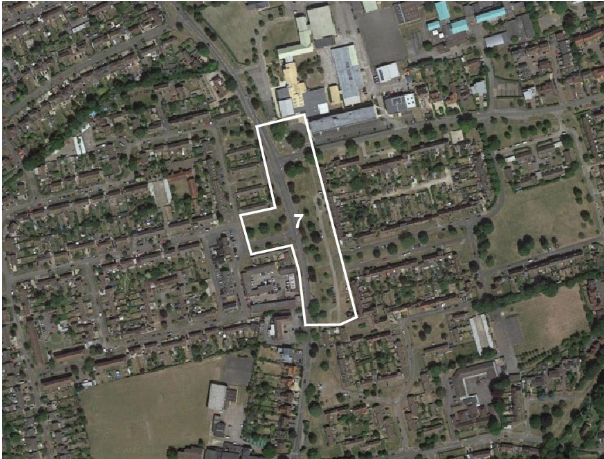
7. Land at Borough Walk