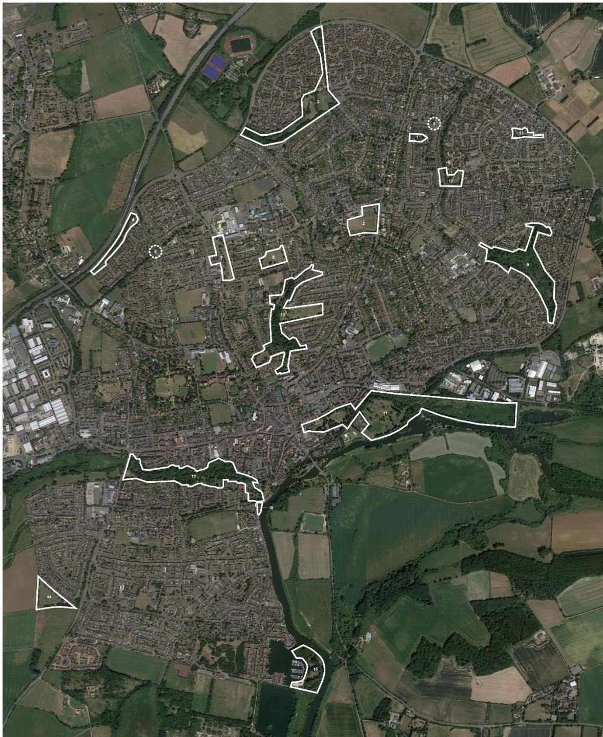
Overview map of all 17 LGS sites