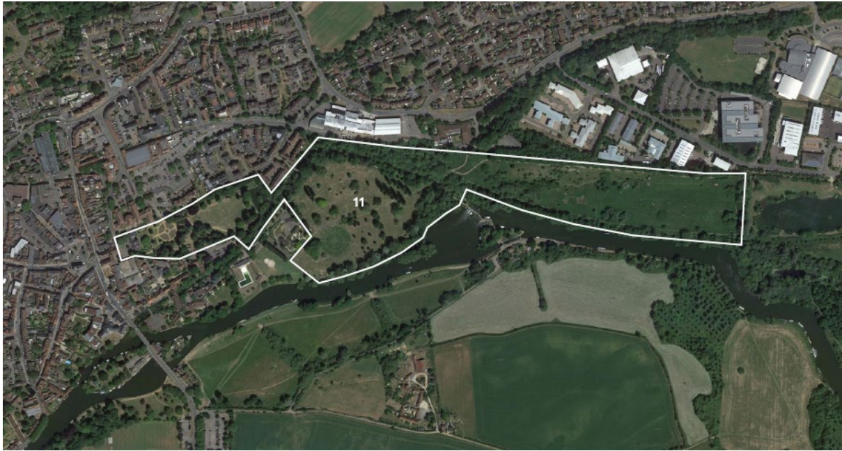
11. Land at Barton Fields