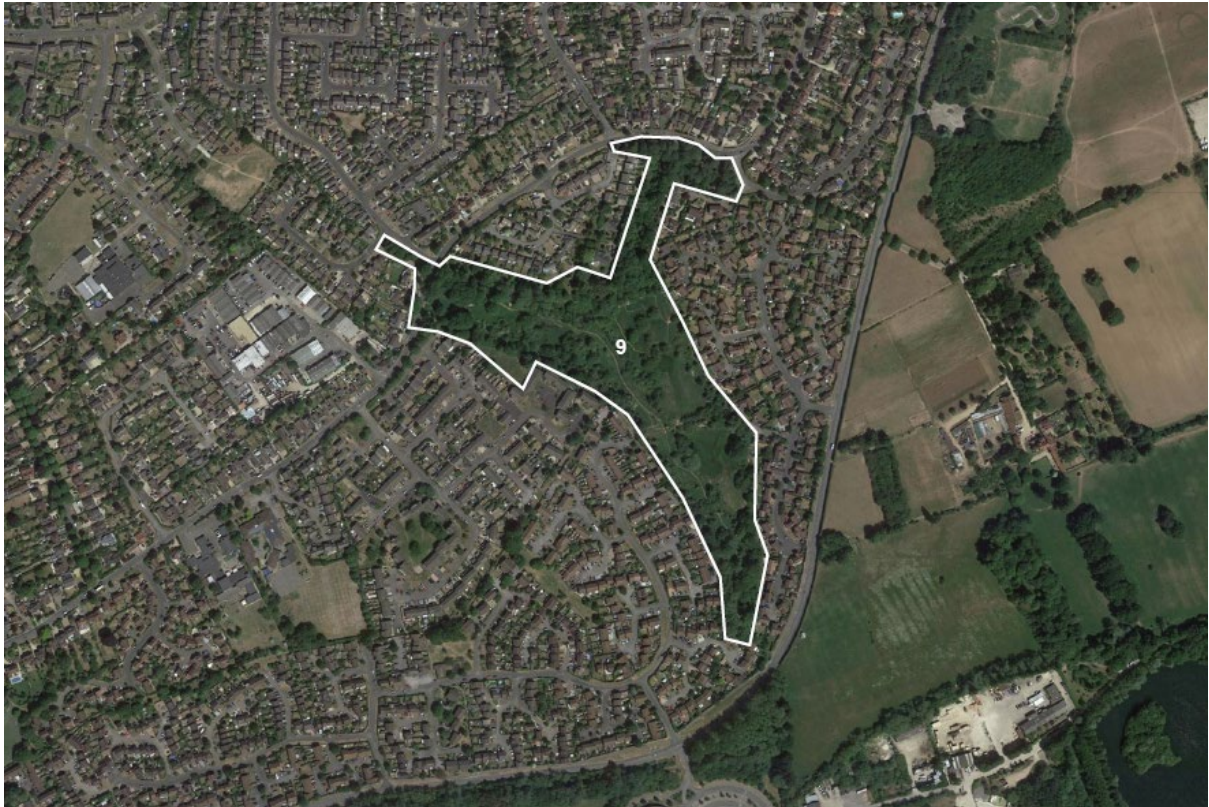
9. Land at Abbey Fishponds Nature Reserve