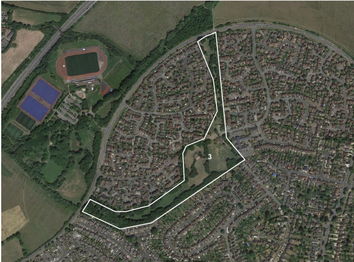
3. Land at Long Furlong