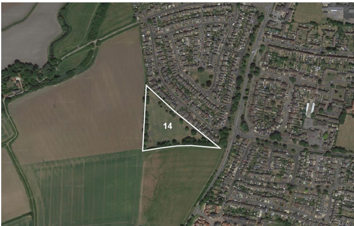
14. Land south of Masefield Crescent