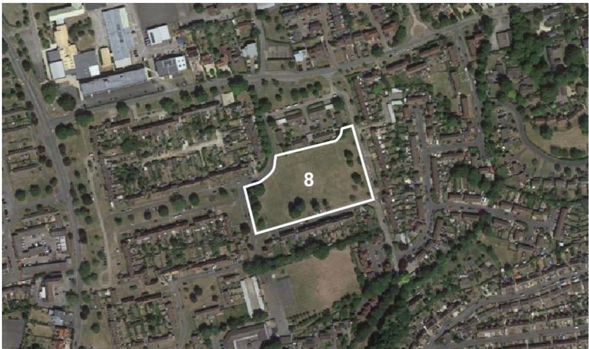
8. Land north of Heron's Walk