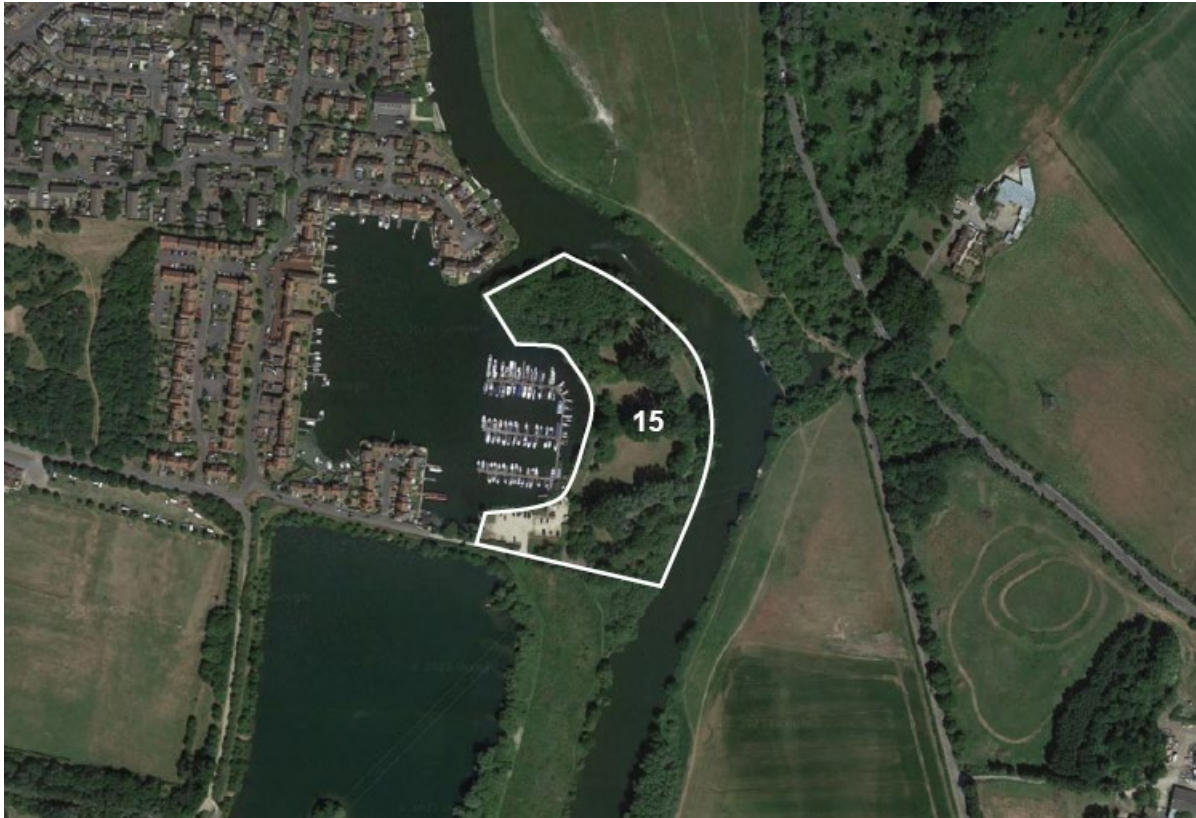
15. Abingdon Marina Park