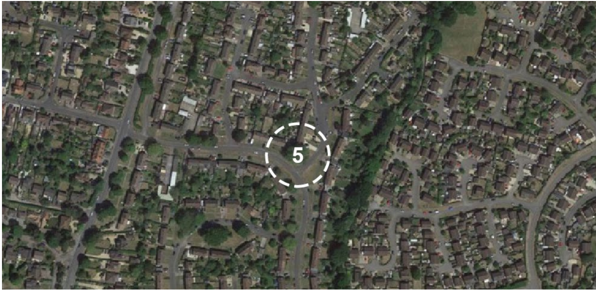
5. Land between Appleford Drive and Compton Drive (approx. location)