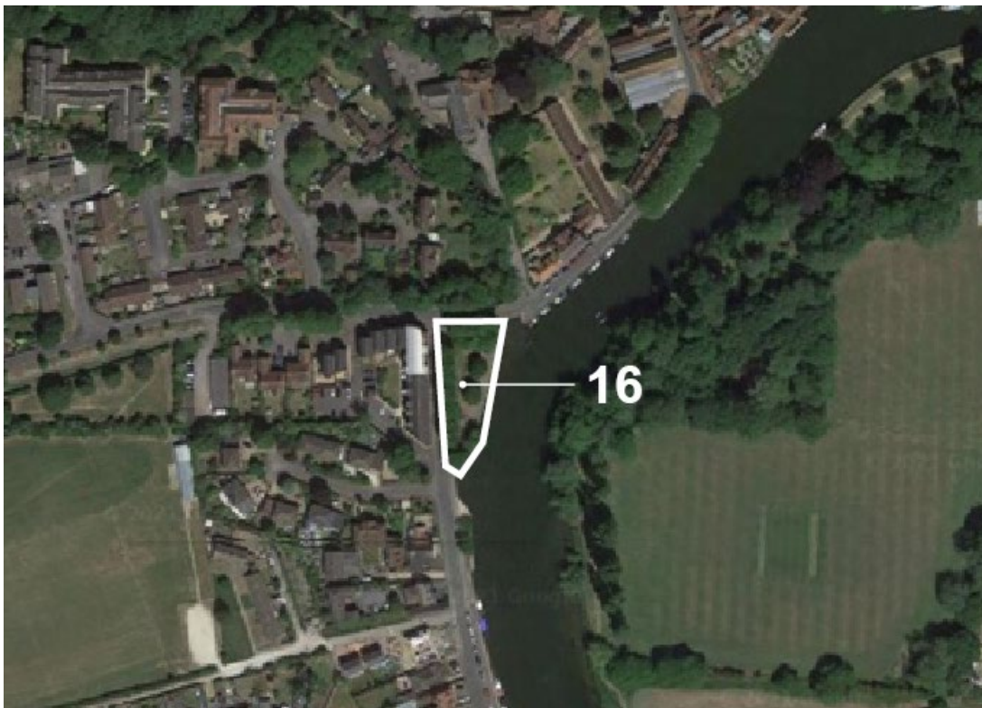
16. Margaret Brown Gardens