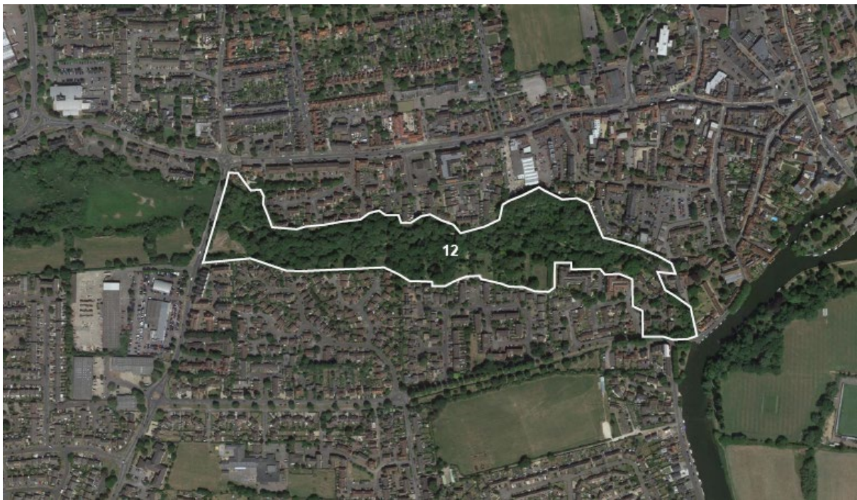
12. Land at Ock Valley Walk