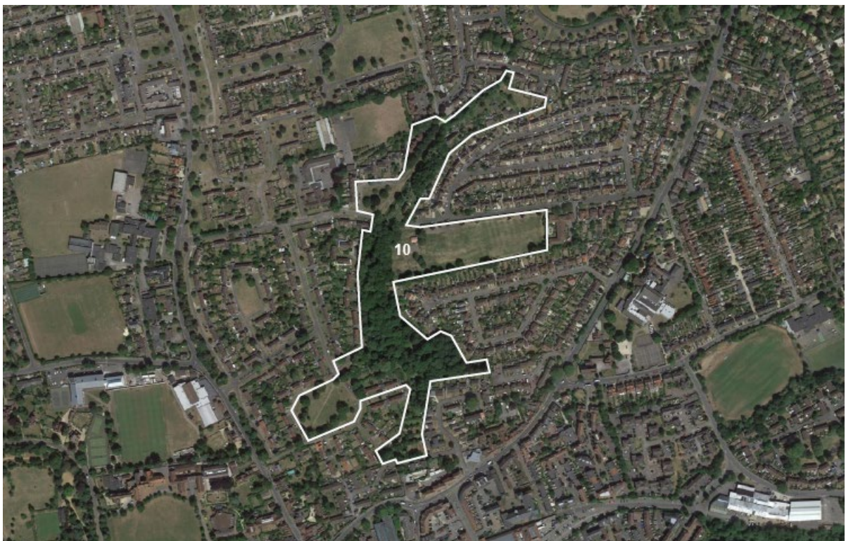
10. Land at Boxhill Wood