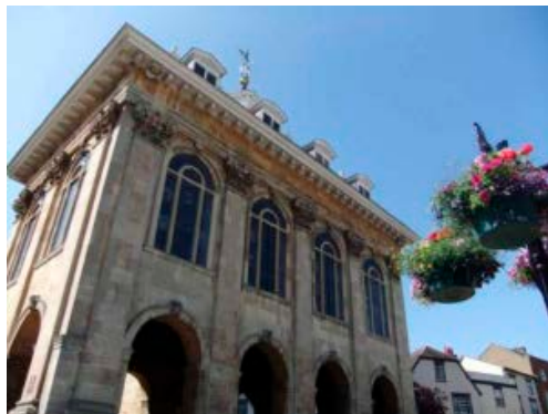
County Hall and the Town Museum within it are funded by the Town Council.

The Town Council will pay for speed indicator devices in Abingdon and is also contributing to improved CCTV in the town, with new digital cameras being installed by the district council.